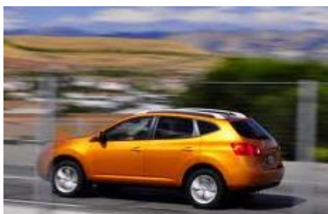
Figure 1. Picture for interview task 1