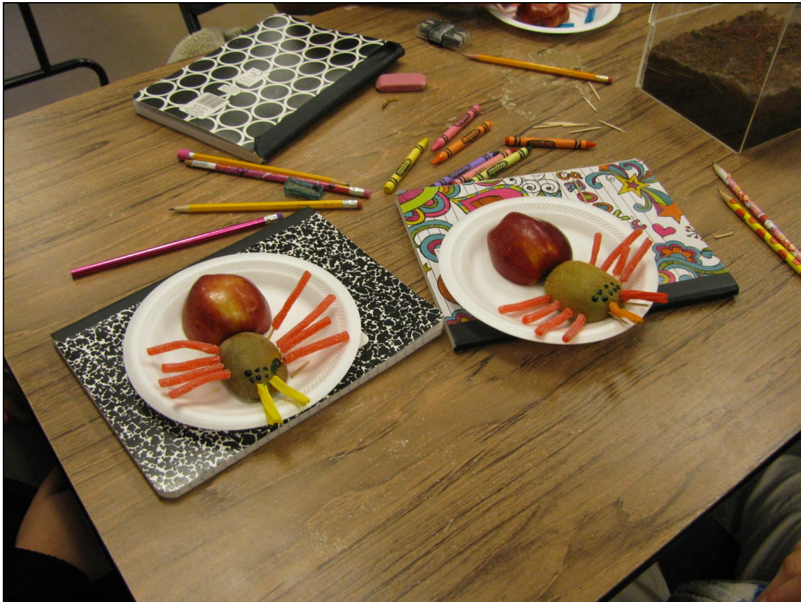
Figure 3. An example of two children's spider models built from fruit and candy.

Other shorter enjoyable hands-on spider lessons occurred during the main activity that let the children observe the spiders and their behavior. For example, Figure 3 shows anatomically correct spiders that children made after observing the living Poecilotheria spiders. This lesson also allowed the children to explore how the spider's characteristics allow them to perform ecologically beneficial services that strengthen ecosystems.