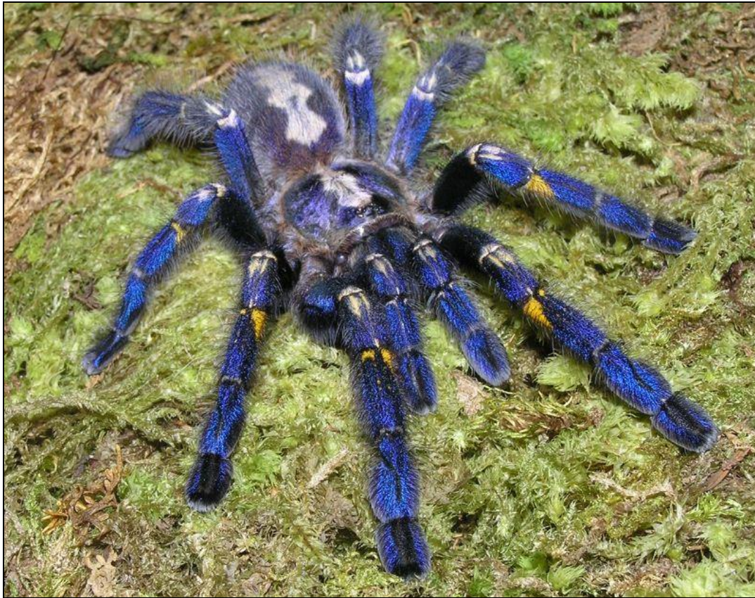
Figure 1. The critically endangered Indian arboreal spider Poecilotheria metallica . Photograph used with permission. Photograph by Tom Patterson.